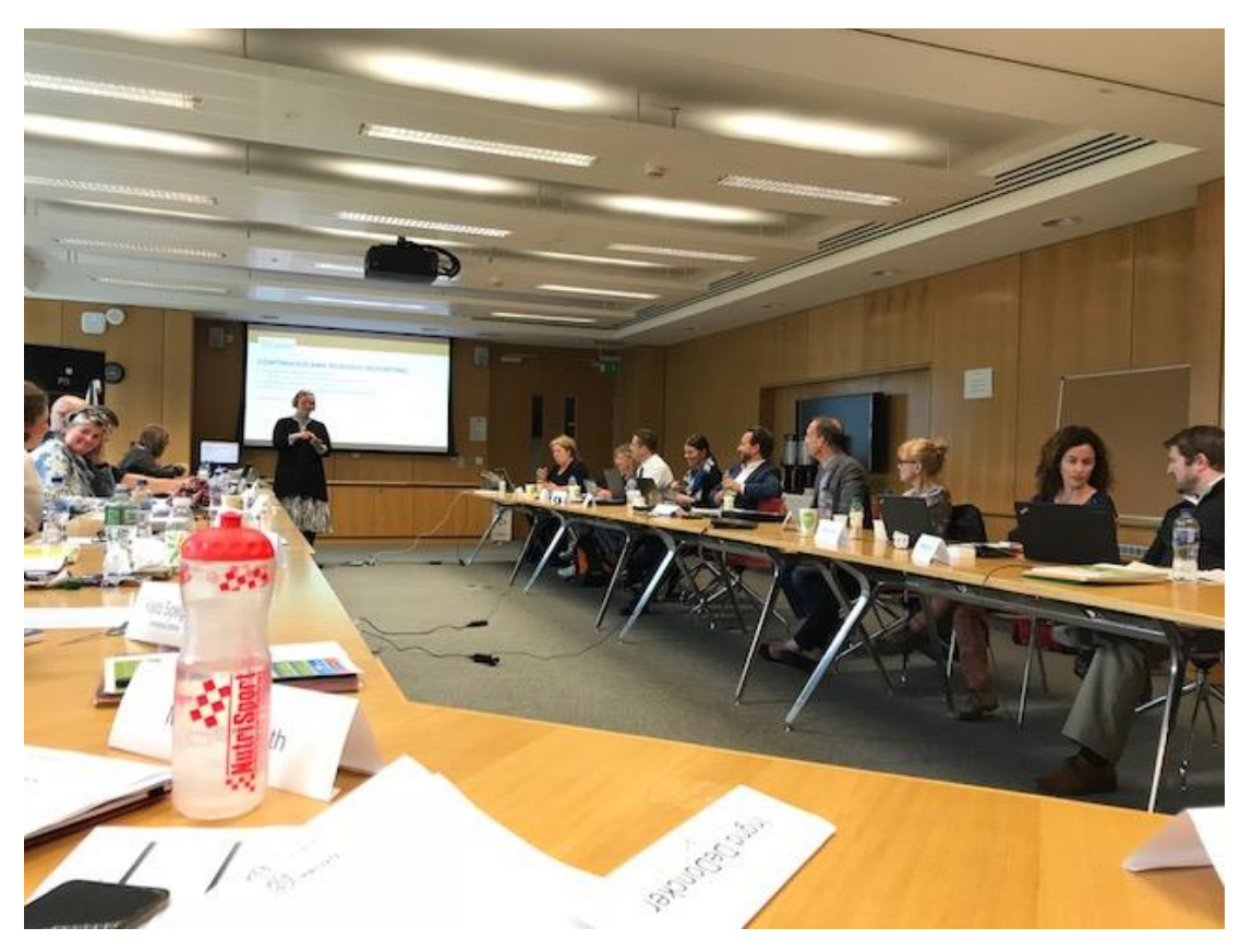
p2i - 35 EU procurers are collaborating in Cork

The Procurement Transformation Institute are delighted to be hosting the other procure2innovate member countries this week in Cork.